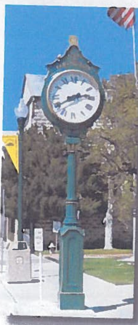
Yerington Rotary Yerington, NV