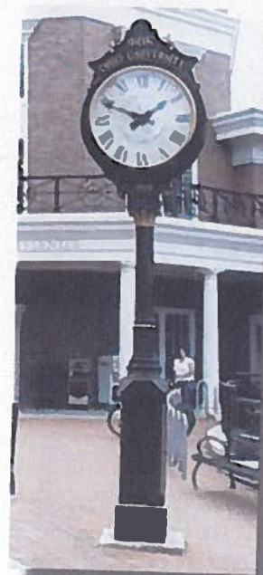
Ohio University - Athens, OH