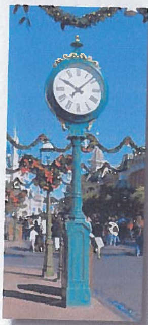
Orlando, FL - Main Street