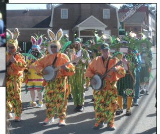
A Mummer's String Band