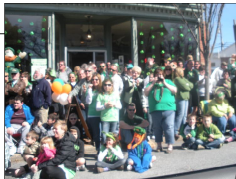
In front of Irish Eyes in anticipation...