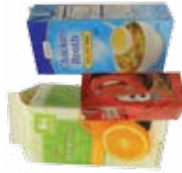
Aseptic containers and cartons