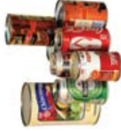
Aluminum and steel / tin cans