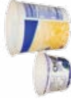
Yogurt and butter containers