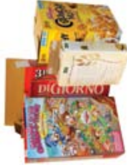
Boxboard (cereal boxes)