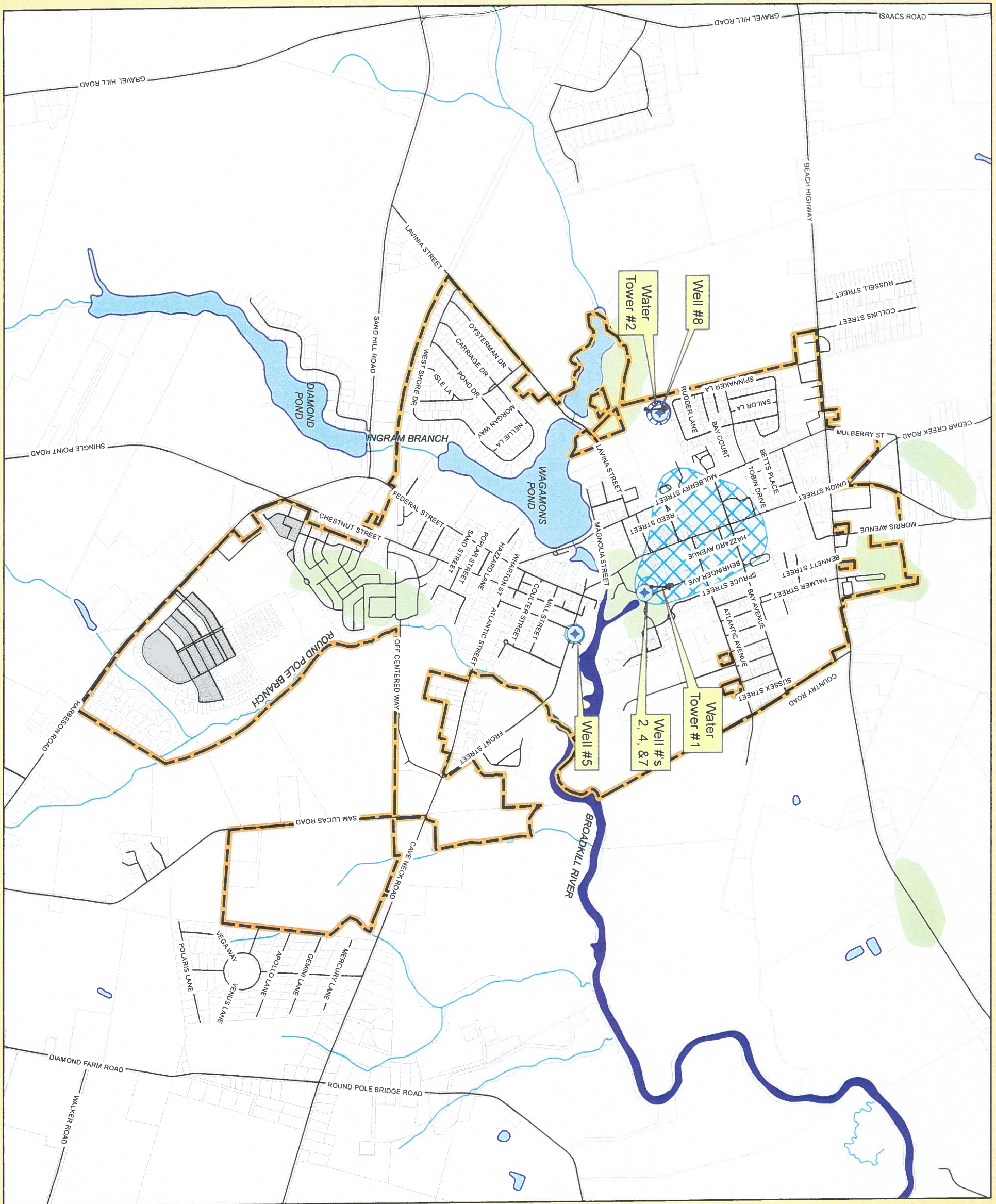
Exhibit K: Source Water Resources