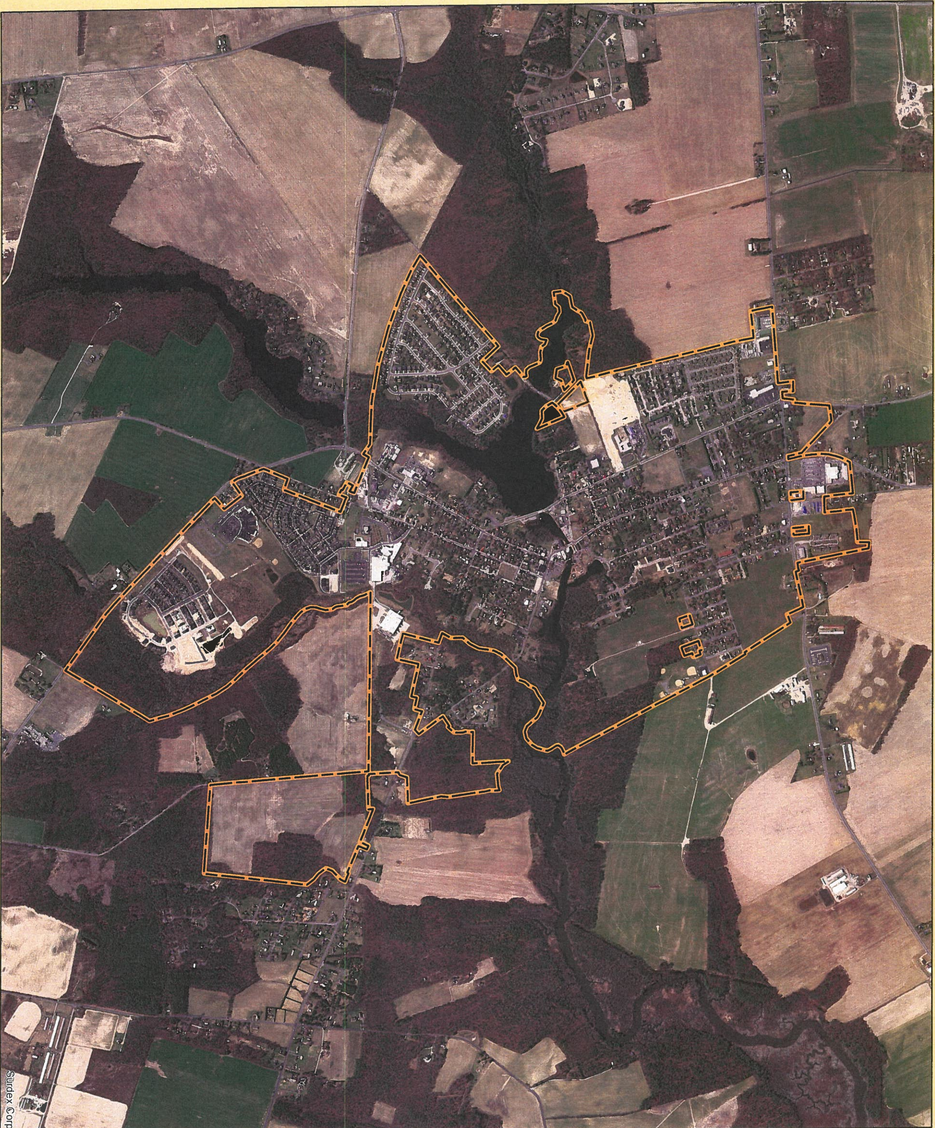
Exhibit B: Aerial View (2017)