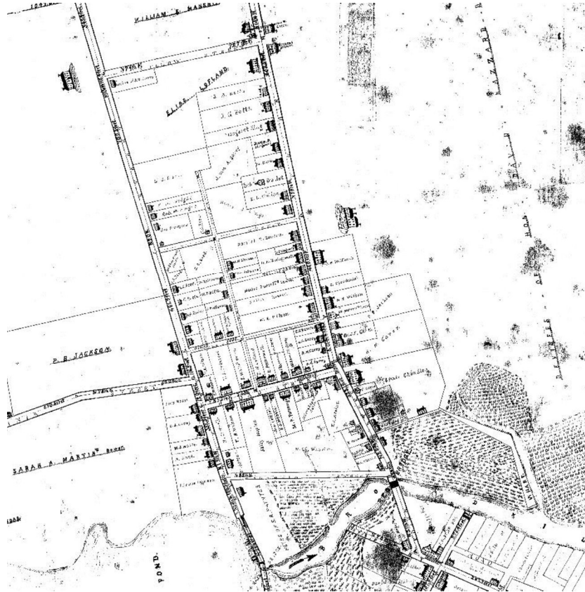
Historic Milton, 1887